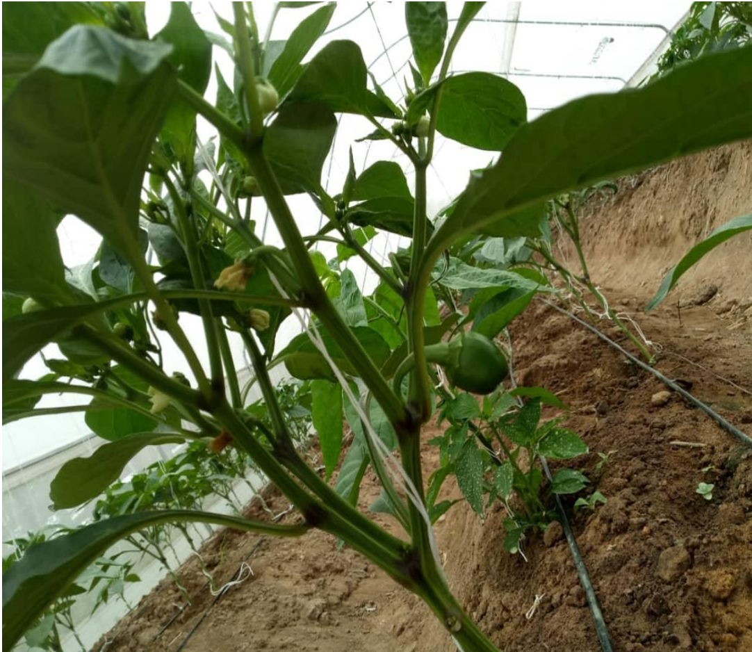
Plate 4: Pictorial view of the number of fruits under poly-house