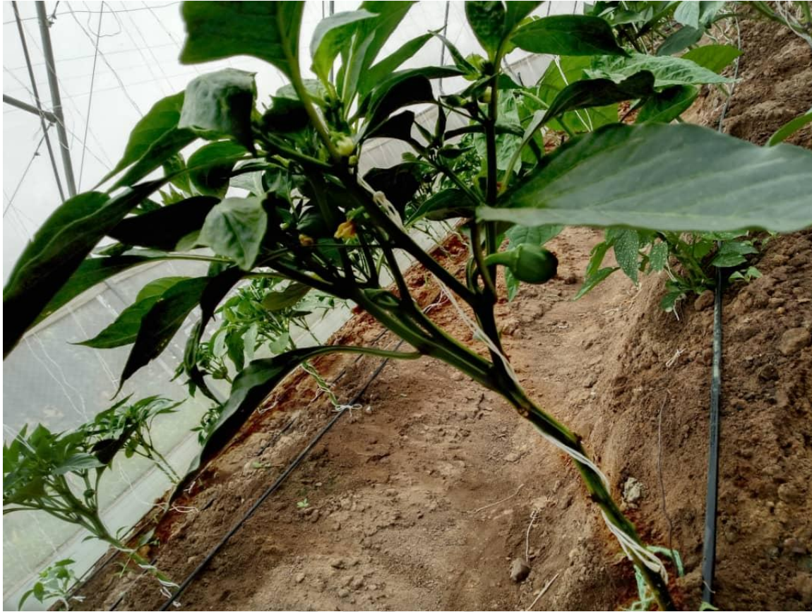
Plate 3: Stem girth of green pepper