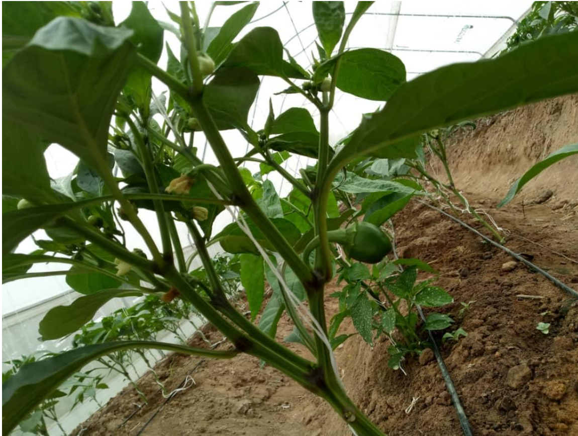
Plate 1: Number of leaves of green pepper under poly-house