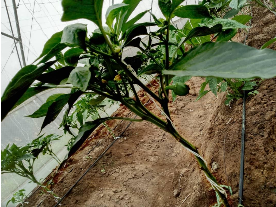
Plate 3: Stem girth of green pepper