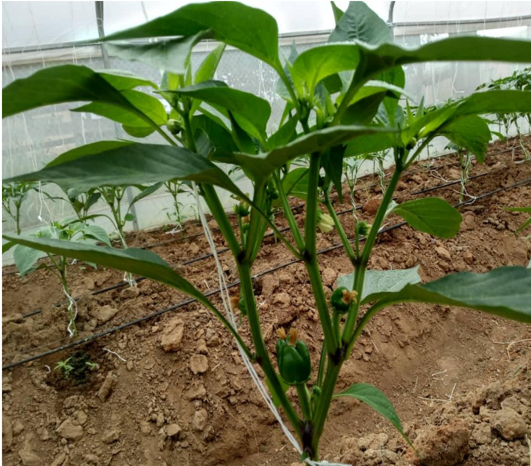
Plate 2: Plant height of green pepper