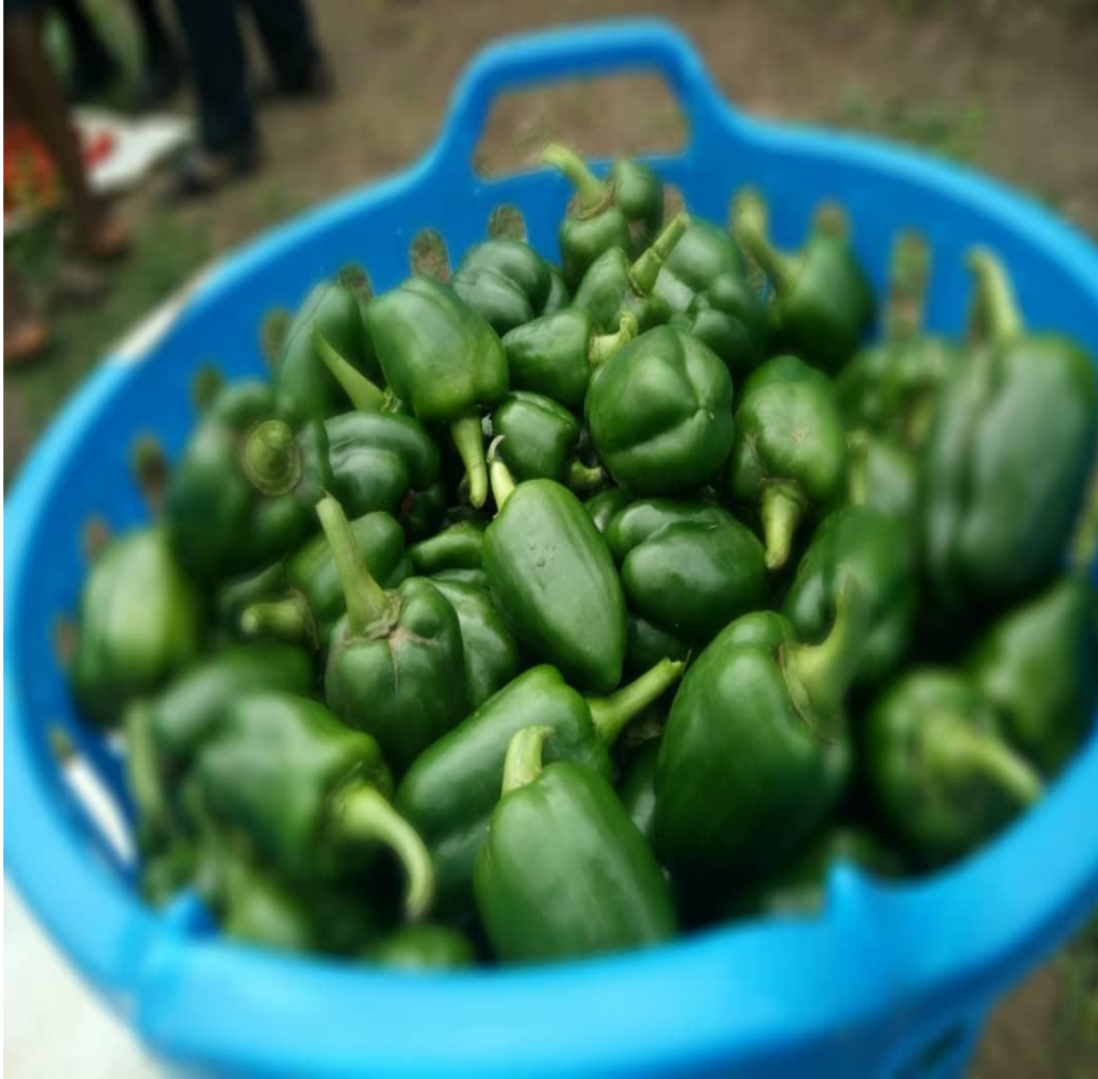
Plate 5: Harvested fresh fruits of green pepper

The differences observed between poly-house and open-field conditions can be attributed to various factors. Poly-house environments offer controlled climate conditions, contributing to enhanced plant growth compared to the open-field, where plants are subject to more variable weather conditions. The higher crop performance observed in the poly-house condition shows the potential advantages of controlled environments for promoting plant growth. These findings align closely with the research of Ali and Kelly (1993), Polowick and Sawlaney (1985), Kumari (1988), and Beese et al. (1982). There were fewer number of leaves, reduced plant height, stem girth, and number of flowers in 2021/2022 growing season compared to the 2020/2021 growing