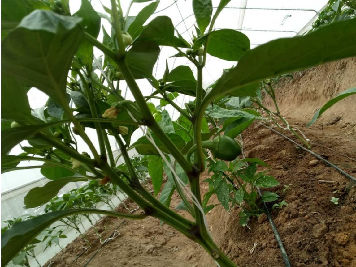
Plate 1: Number of leaves of green pepper under poly-house