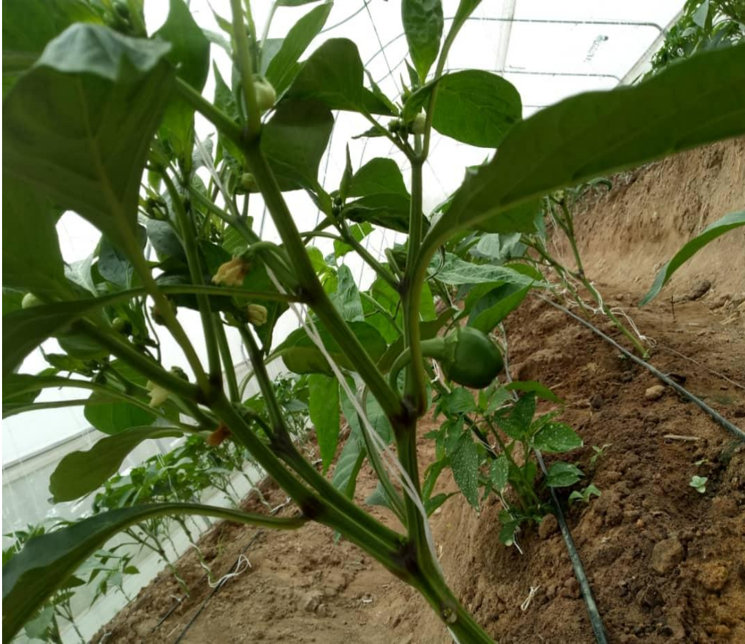
Plate 4: Pictorial view of the number of fruits under poly-house