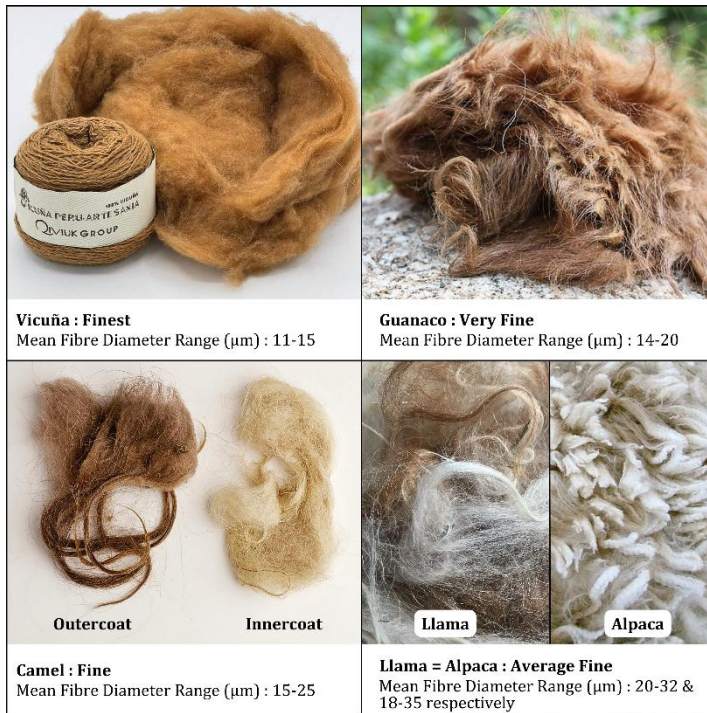
Fig.2.Comparison of fibre fineness between different camelids species

What sets alpacas apart from other camelids is their specialized breeding for the sole purpose of fibre production. Two varieties of alpacas exist: Suri and Huacaya , each exhibiting distinct fibre qualities. Suri alpacas, known for their scarcity, showcase fine, long, silky fibres, in contrast to the more common, shorter, and coarser fibres of Huacaya alpacas. The average length of alpaca fibres falls between 125 and over 200 mm [108]. The 22.5 \mu\text{m} baby alpaca hair stands as the finest among alpaca fibres, surpassing even the excellence of Suri alpaca, and is used in developing women's scarves and stoles. Out of the extensive range of over 52 potential natural colors, industry-wise, white and grey hold the highest value [109]. The inherent medullated nature of alpaca fibres contributes to the widely recognized soft, warm, lightweight, and luxurious qualities of alpaca fabrics, outperforming un-medullated wool. The Alpaca fibre market is anticipated to attain a value of $5.32 billion by the end of 2033, according to the most recent analysis, marking an impressive increase from its 2023 market size of USD 3.65 billion [110].