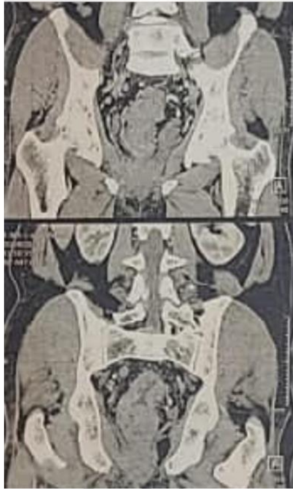
Fig 3 : Coronal section CT scan showing circumferential, irregular, stenosing rectal parietal thickening