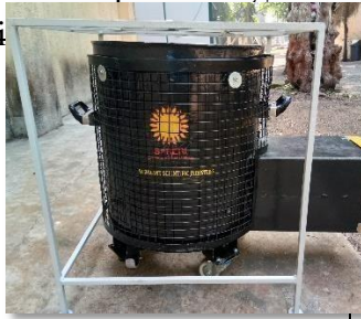
Figure 1: Front view image of Dhaba-sized cook stove system.

Figure 1 and 2 shows the Dhaba type improved biomass cookstove to reduce the rudger of the people involved in Dhaba or small eateries. Rural residents mostly used conventional-style C-type cookstoves for domestic use and Dhaba-size cookstoves for commercial or community-based applications [14]. Roadside Dhaba uses wood as a cooking fuel in commercial applications. These types of cook stoves have a very low efficiency of about 10-12% and produce a lot of smoke [15]–[17]. Cooking with solid biomass fuel releases dangerous gases on a large scale and has a direct impact on the greenhouse effect and carbon emission.