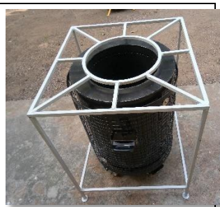
Figure 2: Top view image of Dhaba-sized cook stove system.

The biomass cook stove for efficient and economic use in small restaurants, Dhaba, and Nasta houses in rural areas. The criteria like daily fuel wood consumption, wood size, cooking time, and ash disposal were considered in redesigning the cookstove. For the development of the Dhaba size improved biomass cook stove, in-house testing was carried out, and the performance of various parameters of the Dhaba size improved biomass cook stove was analyzed by SPRE RI, Anand.