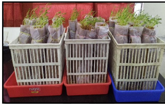
Figure 1. Seed quality testing of chickpea seeds using the paper towel method