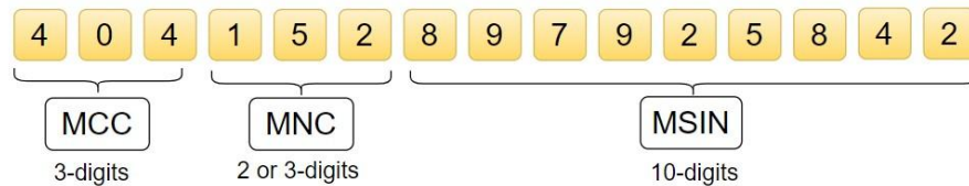
Figure 3. Format of International Mobile Subscriber Identity (IMSI) Number

The International Mobile Subscriber Identity (IMSI) number is a unique number containing fifteen digits which is to be allocated to the user by the operator at the time of purchasing the Subscriber Identity Module (SIM) card. In the hand-held device, it takes 64 bits as represented in the following figure 3.