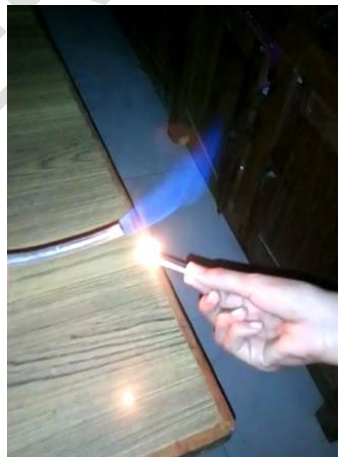
Flame of Biogas burning

The biogas produced from different ratios was tested for its flammability. It was seen that flame last for few seconds from all ratios but the maximum amount of flame was produced from the sample E which contains maximum amount of Coconut water than other samples. The flame produced from biogas by burning the sample ratio illustrated in the Fig.3