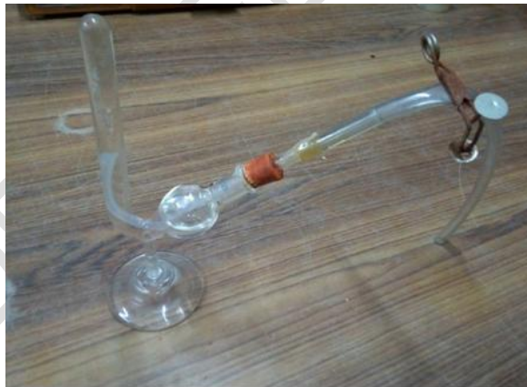
Measuring Biogas Methane content using Saccharometer