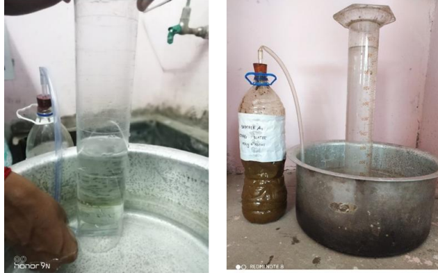
Water displacement method - Biogas volume measurement