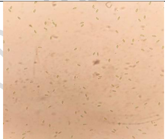
Fig. 2: - Microscopic image of conidia (40x)