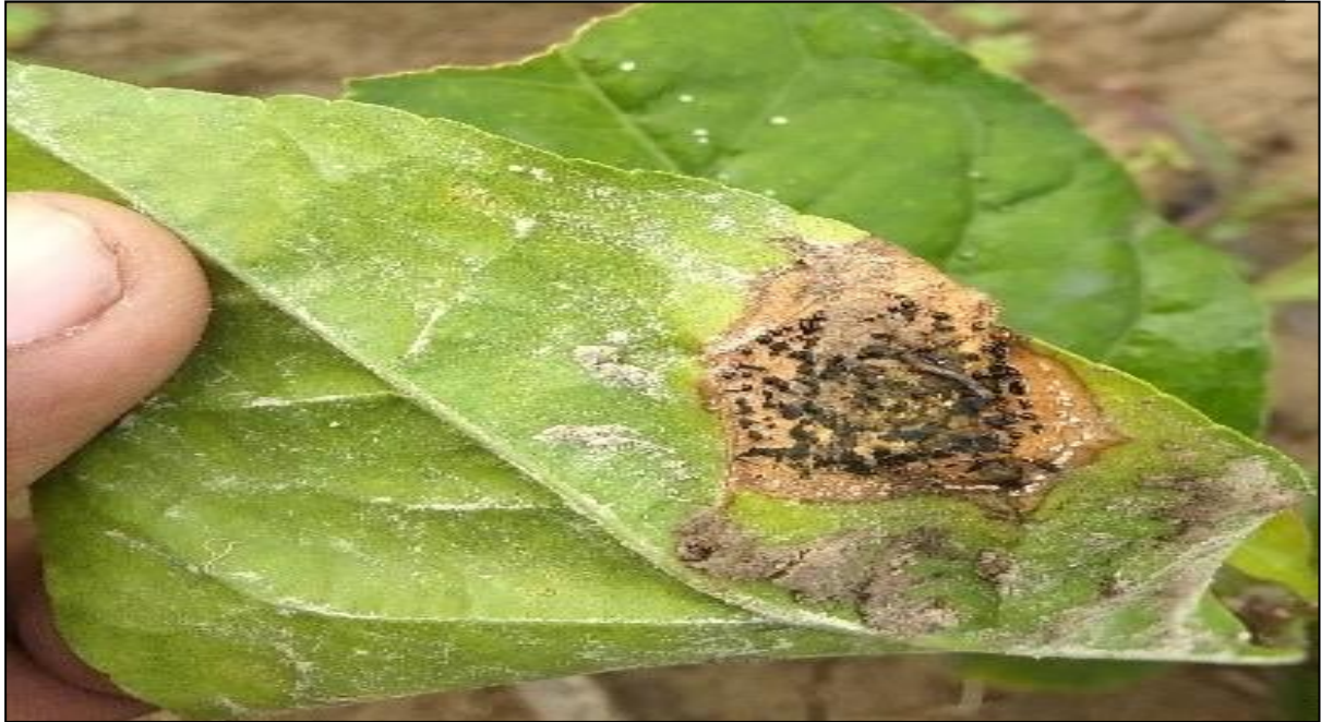
Fig. 3: Symptoms of Myrothecium roridum