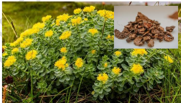
Figure 2. Image of Rhodiola rosea aerial part (central picture) and slices of dried rhizomes (top right picture)