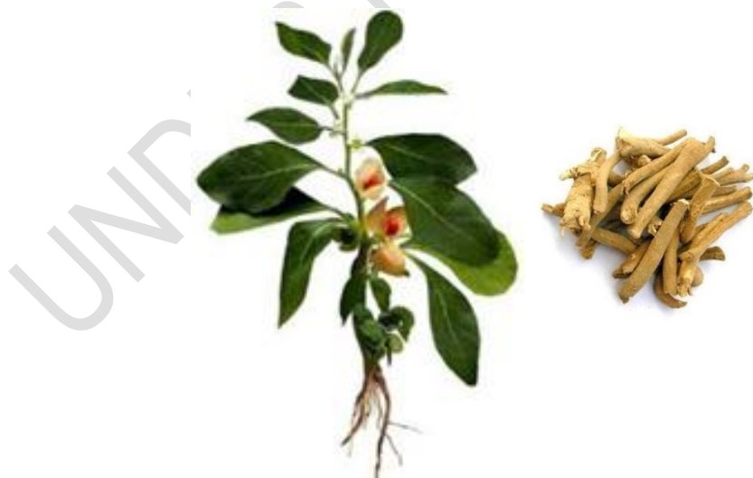
Figure 4. Images of the whole plant (left) and dried roots (right) of Withania somnifera