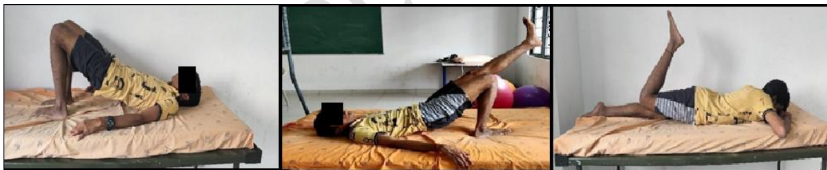
Figure 2. Gluteus Maximus Activation Exercise

Exercises for gluteus maximus activation included crook lying activation, bridging both unilateral and bilateral activation, and prone lying hip lift (Figure 2).