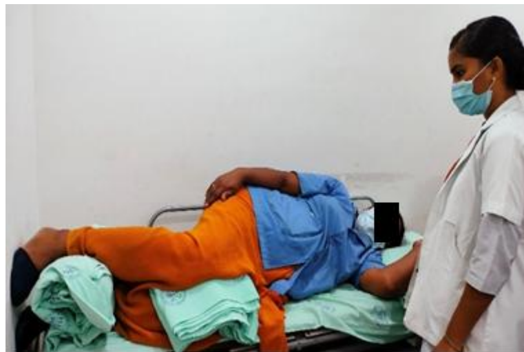
Figure 1. Adductor Pull Back Exercise

then asked to relax before bending their knees to return to their initial posture, repeating the process four more times.