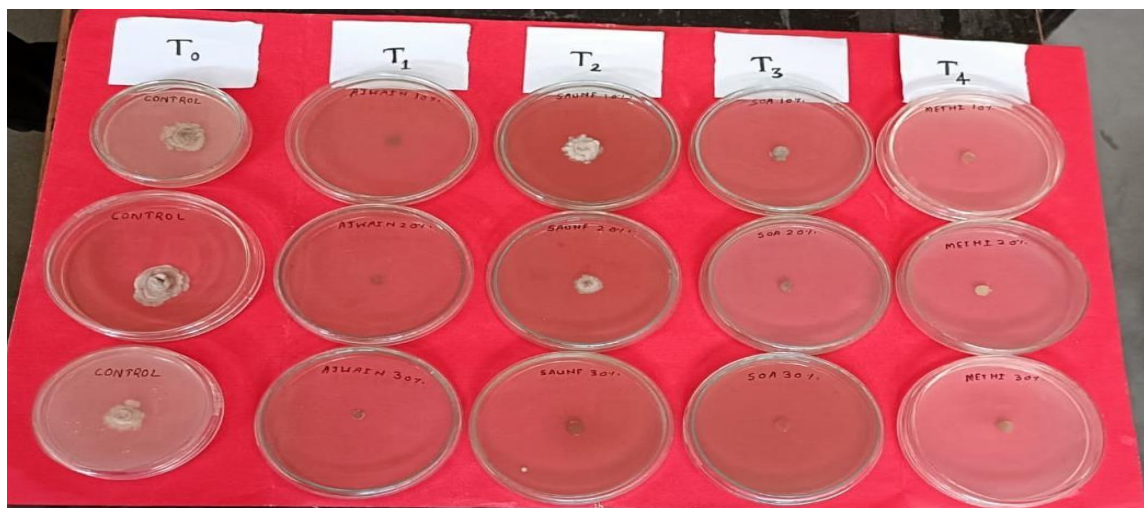
Fig. 3. Response of botanicals against Agaricus bisporus on mycelial growth