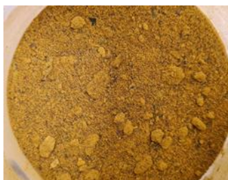
Figure 1. Propolis

The chemical composition of propolis depends on the time and place from where it was collected, figure 1. It can vary in the amount of resin, oil, organic materials, type of metals, and concentration of flavonoids. Vitamins B1, B2, B6, C, E and minerals as silver, copper, manganese, iron, aluminium, potassium can be found in propolis (14) . Flavonoids have a direct impact on immunomodulation and immunosuppression which occurs in plants as a result of infection with different pathogens, it represents a natural reaction of its immune system to remove a pathogen from an infected organism (15) .