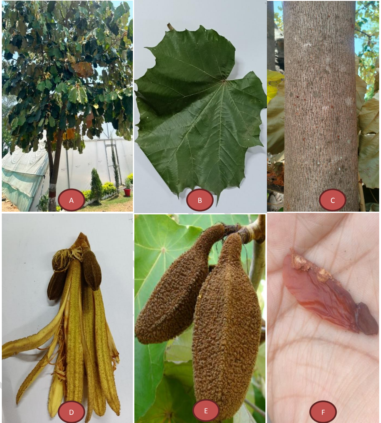
Figure 2: Plant morphology of Pterospermum acerifolium A: Plant; B: Leaf; C: Stem bark; D: Flower; E: Fruit; F: Winged seed