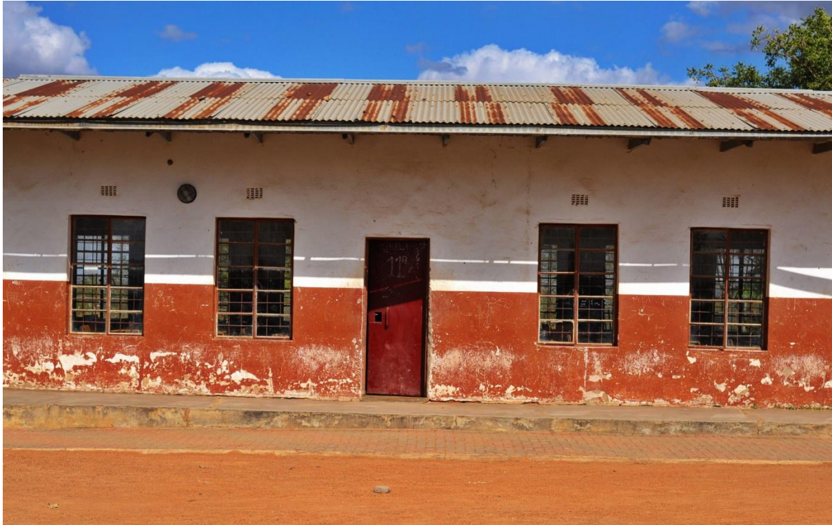
Fig 2. Netshimbupfe Secondary School. (Example of schools still found in South Africa. However, there are number of new ones built but still having huge backlog in some areas. This is Netshimbupfe Secondary School block built in 1975.) Photo by Lucas Ledwaba, 8 June 2020.