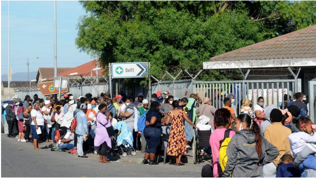
Fig 3. Overcrowding in Delft Community Health Clinic, Cape Town, South Africa. 17 August 2023.