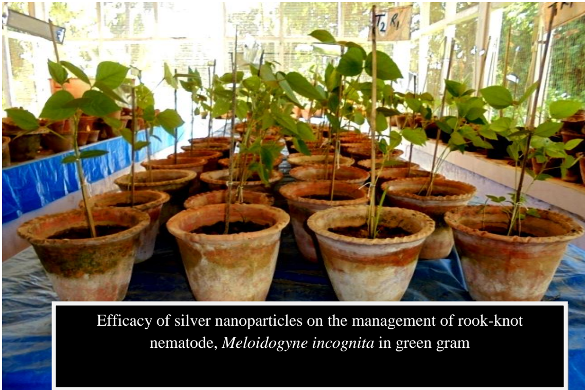
Plate 1. General view of the pot experiment