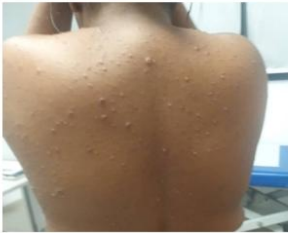
Figures 1 & 2: Lesions of different ages (vesicles, pustules, umbilicated papules and crusts).