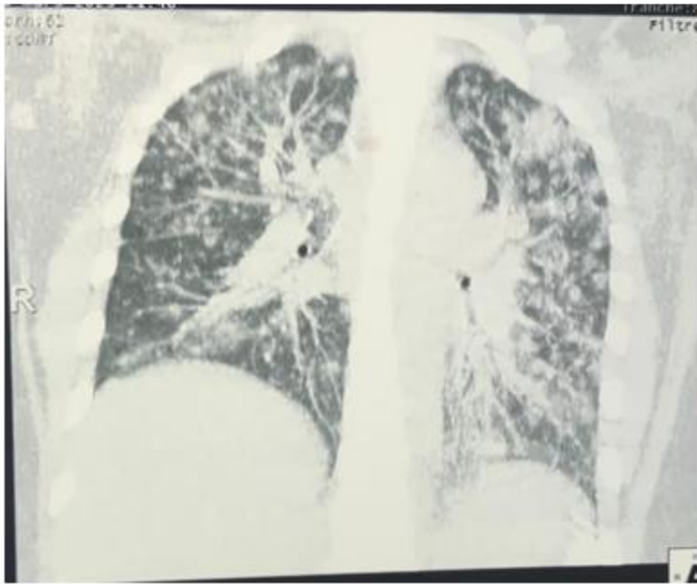
Figure 3 and 4: Thoracic CT scan showing diffuse pulmonary nodules and micronodules in both lung fields.