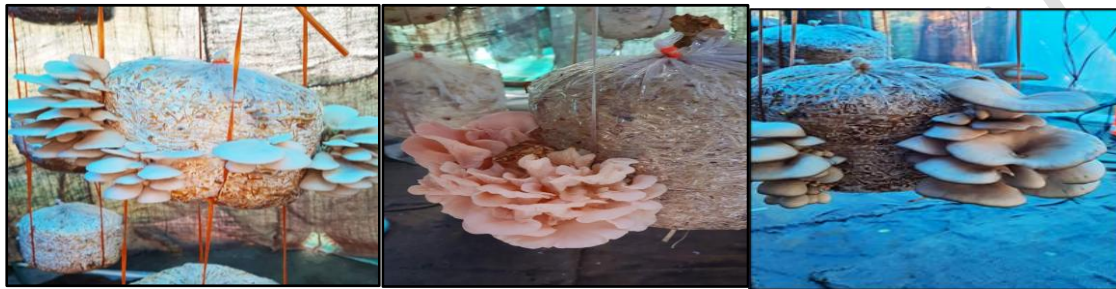
P. florida. P. djamora P. sajorcaju

2.5.5 Harvesting –The right stage for picking of mushroom can be judged based on the shape and size of fruiting bodies. It was handpicked before spraying water. As the mushroom begin fruiting, it's important to the humidity high. Temperature can now be higher for the initial picking stage. Harvesting is done after 20-25 days when oyster mushroom mature. Simultaneously, four crops of mushroom are harvested at an interval of 4-5 days.