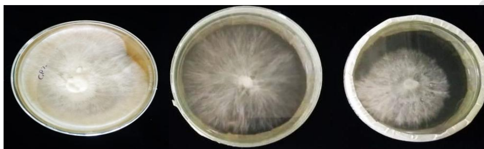
Fig.2. P.sajorcaju P.florida . P.djamor

Radial growth – Among the 3 isolates of Pleurotus minimum number of days were required by P.sajorcaju to cover the petriplate. Observation was noted on Day 3, Day 9 & Day 13. In P.sajorcaju on Day 3 (17.0 mm), Day 9 (39.33 mm) and on Day 13 (75 mm) radial growth followed by P.florida which covered (12.53 mm) of petriplate on Day 3 (32.35 mm) on Day 9 and (70.55 mm) on Day 13 and very less mycelium growth was observed in P.djamori.e (9.8 mm) on Day 3 , on Day 9 it covered (27.33 mm) and in Day 13 it covered (57.53mm) respectively.