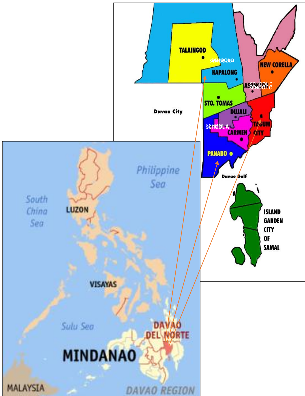
Figure 2. Map of the Philippines highlighting the public colleges of Davao del Norte