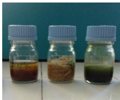
Fig. 3. Maceration of Bark, stem and root extracts of C.timorensis

20g of each part of C. timorensis was ground into a fine powder and added to 100 ml of solvent. The prepared samples were filtered, and the filtrate was considered as the stock crude solution. The extracts were dissolved in distilled water and a dilution series was prepared (200 mg/ml, 150 mg/ml, 100 mg/ml, and 50 mg/ml).