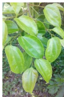
Fig. 1. Celtis timorensis plant Fig. 2. Celtis timorensis leaves