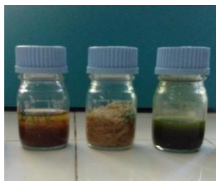
Fig. 3. Maceration of Bark, stem and root extracts of C. timorensis

Comment [AF2]: Font type should be uniform