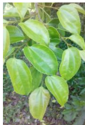
Fig. 1. Celtis timorensis plant Fig. 2. Celtis timorensis leaves