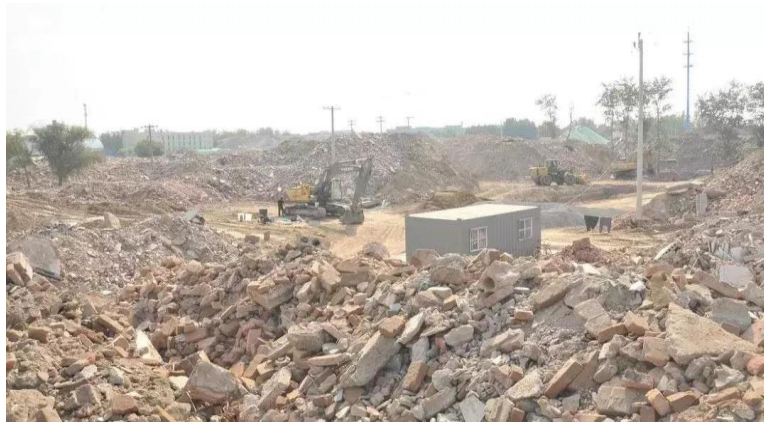
Fig. 1. Construction waste dumping