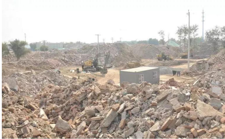
Figure 1. Construction waste dumping