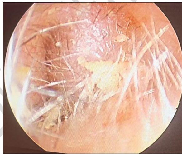
Figure 1: Image of a well-limited rounded mass fill-up the entire external auditory canal

A 75-year-old man presented with progressively reduced hearing and fullness of the right ear for the past 1 year. There was no history of ear pain or recurrent ear discharge. He had no history of tinnitus, bleeding from ear or vertigo . No previous history of surgery or trauma was noted. Physical examination showed no cervical lymphadenopathy. Examination of the parotid gland and facial nerve was unremarkable. Otoscopic examination revealed a mass filling the entire external auditory meatus. The surface was pinkish, smooth, and firm in consistency, occluding the entire ear canal. No collection of discharge was seen in the EAC or surrounding the mass. The mass is non-tender and does not bleed upon palpation. There was no other significant findings on examination. [Figure 1, 2].