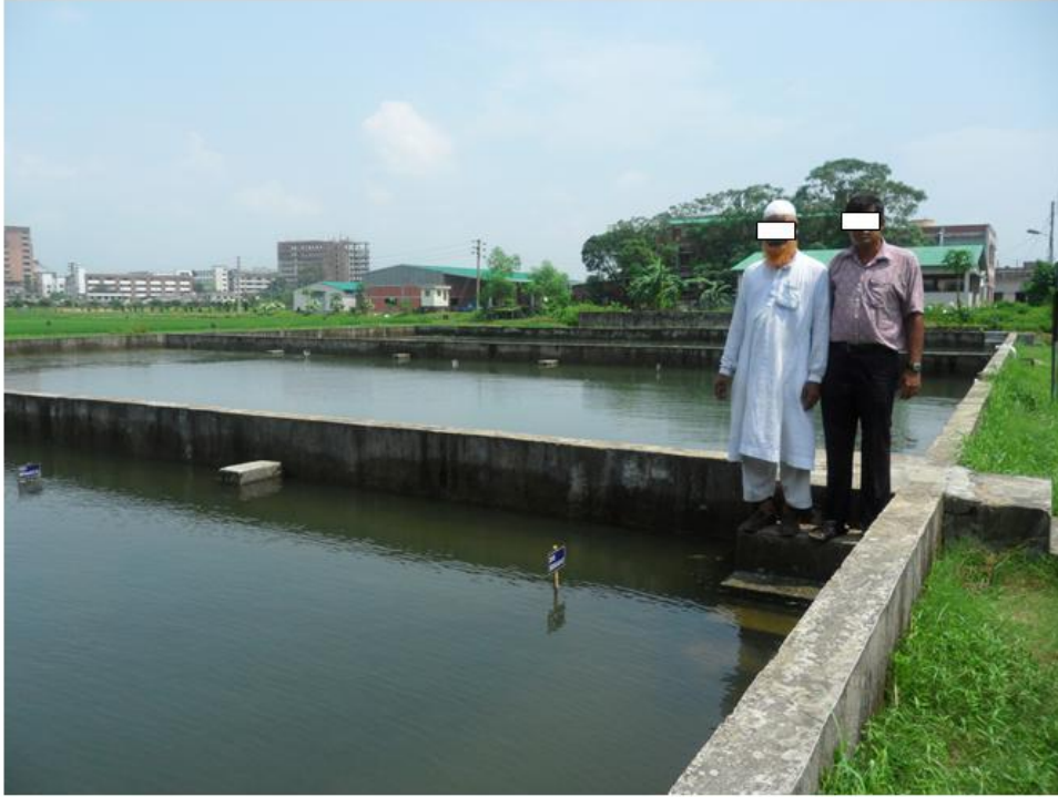
Fig. 2. PVT-Submergence trial was submerged for 25 days at BRRI Gazipur, T. Aman 2016