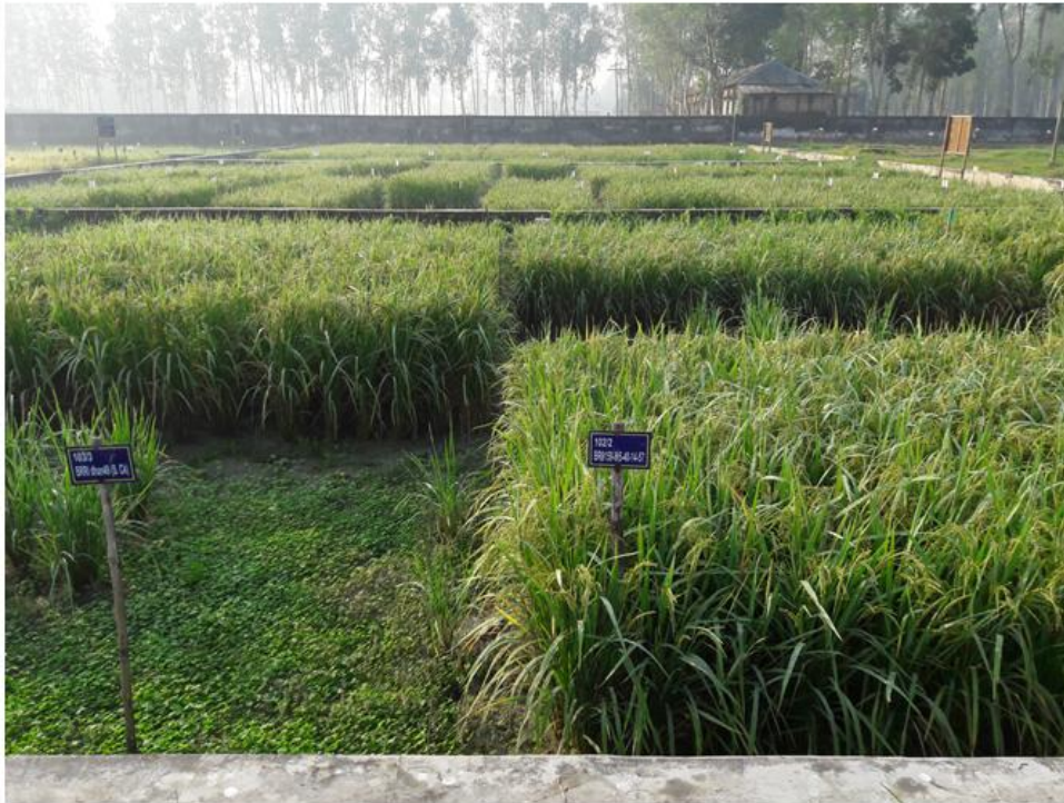
Fig. 3. Mortality of BRRI dhan49 and survival with faster recovery of BR9159-8-5-40-14-57, PVT, BRRI R/S Rangpur, T. Aman 2016

Comment [A47]: Photographs are not required.