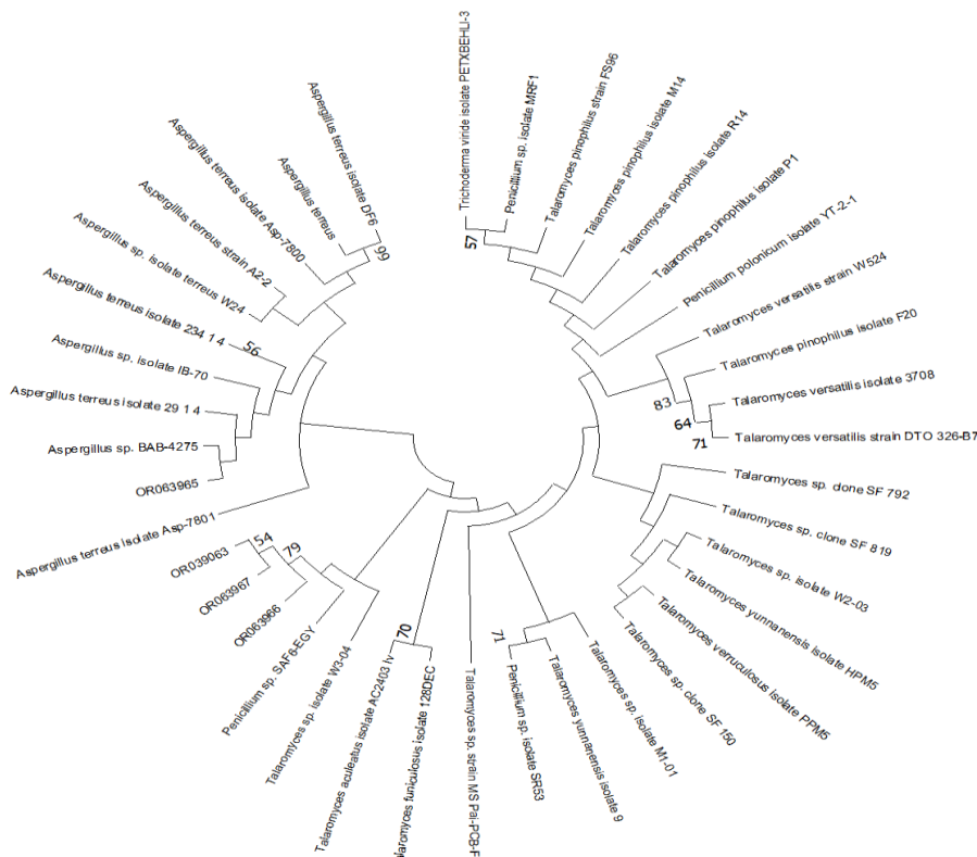
Fig 3: Phylogenetic tree showing genetic relationship between the isolates Talaromyces sp , Talaromyces versatilis , Talaromyces pinophilus and Aspergillus terreus and other closely related reference microorganisms.