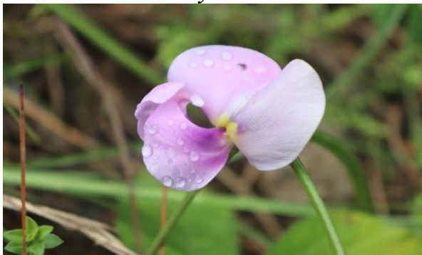
Flower of Vigna vexillata