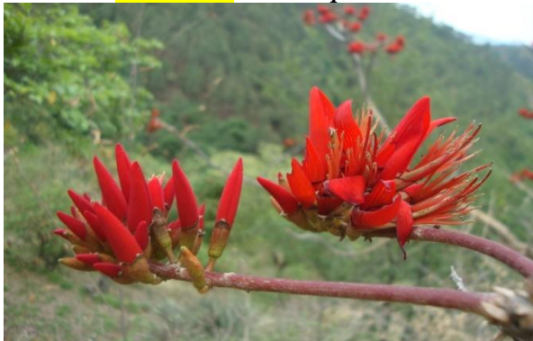
Flowers of Erythrina suberosa