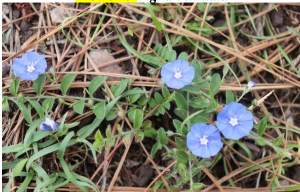
Aerial part of Evolvulus alsinoides