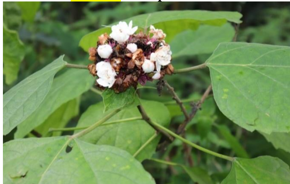
Flowers and leaves of Clerodendrum chinense