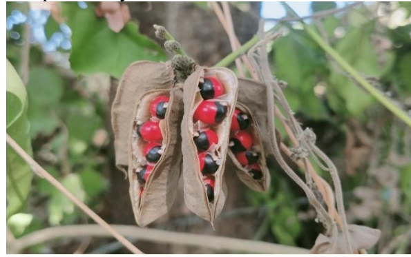
Seeds of Abrus precatorius