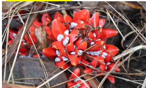
Aerial part of Zingiber chrysanthum