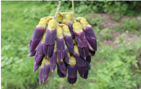
Flowers of Mucuna pruriens