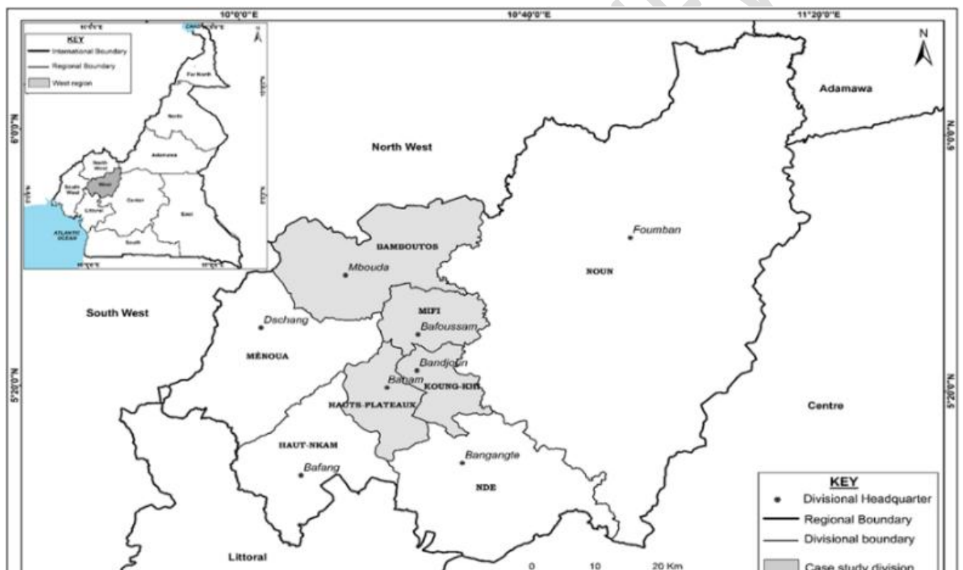
Figure 1. Map of the West Region of Cameroon, showing case study divisions National Institute of Cartography (2020) and Fieldwork (2020)

This study was conducted in the Mifi (5° 28' 45" N, 10° 25' 11" E), Koung-Khi (5° 22' 29" N, 10° 24' 43" E), Bamboutos (5° 37' 34" N, 10° 15' 17" E) and Upper Plateau (5° 20' 05" N, 10° 22' 06" E) Divisions of the West Region of Cameroon as shown in Figure 1.