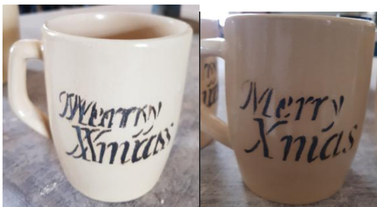
Fig. 4: Enamels from bone ash (left) and tin oxide (right) print on ceramic cups

Physical examination of enamel produced from bone ash had a low bloating when compared with that of tin oxide. Also, the samples decorated with bone ash enamel had a low tendency of crawling [18]. In terms of opacity, the ceramic cups decorated with bone ash and zinc oxide enamels came out brilliantly (Fig. 4). This indicated that cow bone ash is a good enamel opacifier as tin oxide. The durability test of the opacifier produced and that from tin oxide was excellent as the ceramic cups were resistant to acidic and basic attack [15].