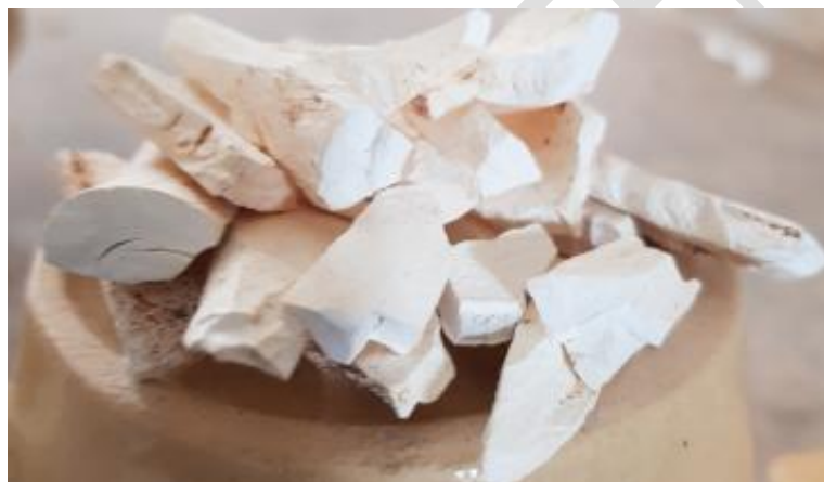
Fig. 1: Cow bone after calcination

The cow bone after calcination is presented in Figures 1 and 2, respectively are the cow bone ash after crushing and the control sample (tin oxide), which was used for comparison.