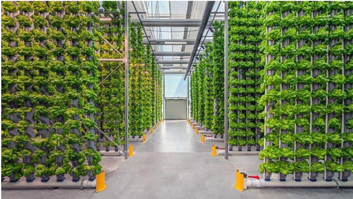
Figure 3. Improved light exposure for indoor hydroponic vs open-field plants

balance growth versus disease proliferation. Tight regulation of all three parameters synergistically fosters sizable performance gains compared to variable outdoor climates.