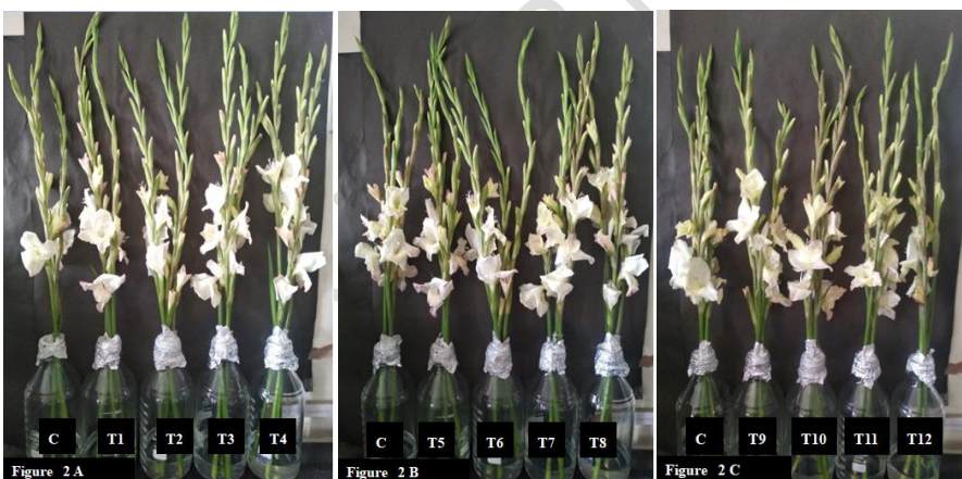
Figure 2A.-Gladiolus flowers variety Pusa Chandni with different treatments of Sodium nitroprusside. Figure 2B.-Gladiolus flowers with different treatment of salicylic acid. Figure 2C.-Gladiolus flowers treatment with combination of Sodium nitroprusside and Salicylic acid.