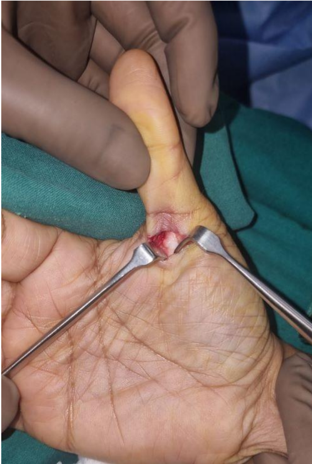
Fig 1. Transverse incision at the thumb flexion crease. Neurovascular bundles dissected and retracted. Ganglion noted over the A1 pulley of thumb flexor sheath.