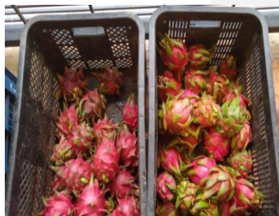
Yield of red and white type