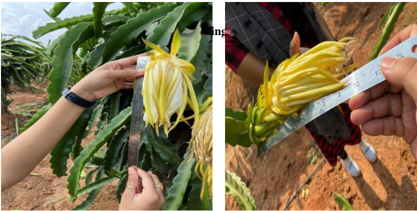
Fig . 1 Length of the flower

NOTE: Mean values in a column having dissimilar letter/s indicate significant differences and similar letters indicate statistically non-significant at 0.05 levels of significance