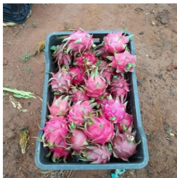
Yield of red type