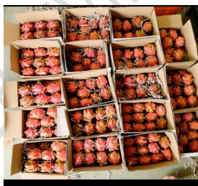
Fig . 3 Packaging Fruit yield and packaging