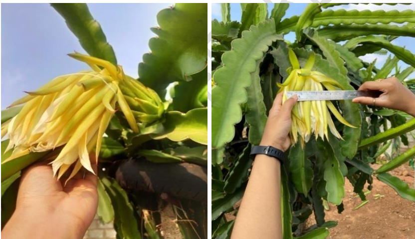
Fig . 2 Breadth of the flower

Various flower parameters recorded during experimentation