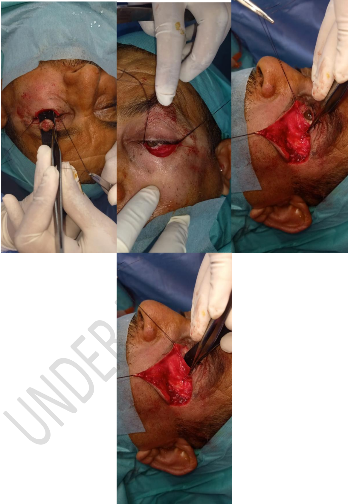
Figure2: excision of the eyelid CBC with removal of the TENZEL flap