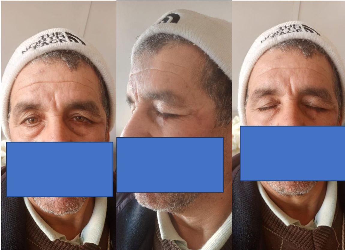
Figure 4: our patient one year after the surgical procedure showing an excellent morphological and functional result