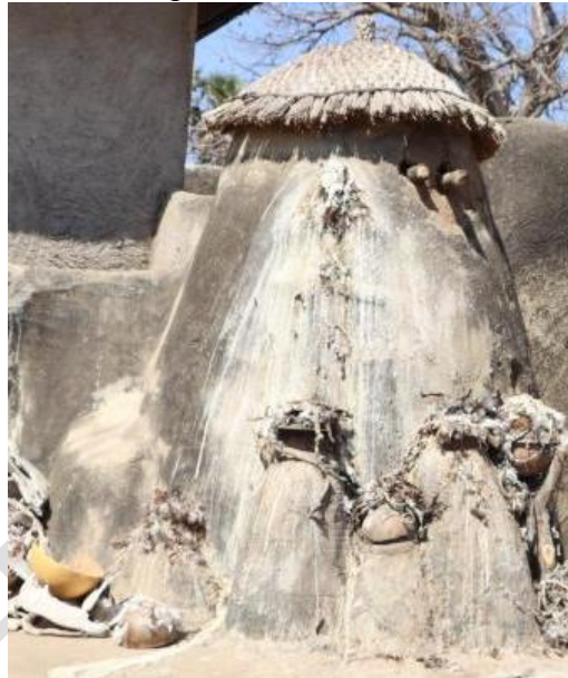
Figure 6a. Personal deity of Chief Golobdan. Appears as a building but an abstract artistic figure representing the personal deity of the chief.