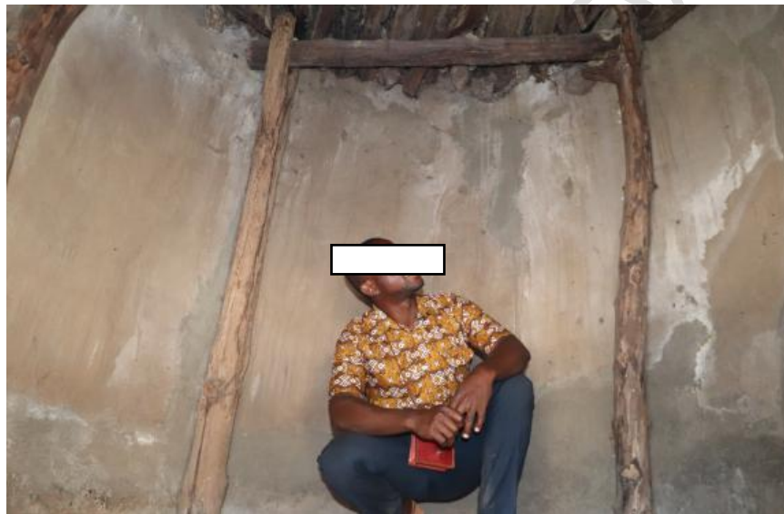
Figure 4. A pose inside the traditional roundhouse in Chief Golobdan's compound showing how the sticks were used as columns to support the flat roofing. ( Source: Fieldwork, 2020 ).

Remarkably, these architectural marvels forgo conventional windows, opting instead for a small, circular aperture that demands a deliberate effort to access the building. Within each structure, a series of small configurations, comprising earthenware pots affixed to raised platforms adorned with furs and bloodstains, coexist with walls embellished with bones extracted from donkey jaws. These installations symbolize the presence of personal deities, providing protective guardianship for those who inhabit the rooms (see Figures 5a & 5b).