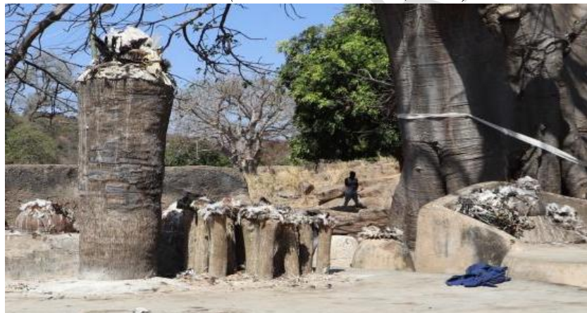
Figure 8b. Details of installations on the circular tombs behind the house of Chief Golobdan. (Source: Fieldwork , 2020).