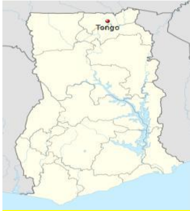
Figure 1. Location of Tongo in Upper East Region on Ghana Map.