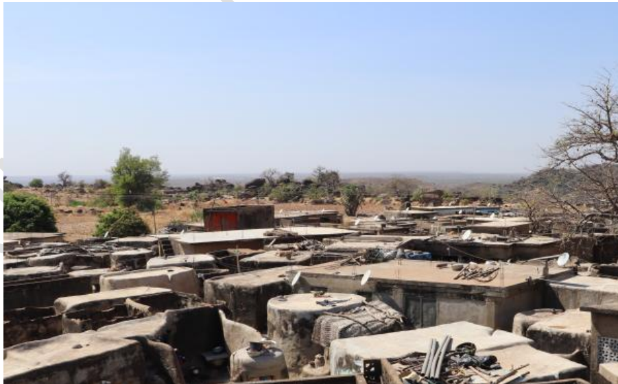
Figure 3. Partial aerial view showing the flat rooftops of the buildings Chief Golobdan's house.

Examining the aerial view of the chief's compound (see Figure 3), the flat rooftops of interconnected round buildings create an artistic representation akin to a complex irregular maze. This architectural layout symbolizes the intricate interrelatedness characterizing the social life within the chief's household. Notably, this labyrinthine structure also signifies a robust bond and protection afforded to the inhabitants, rendering intrusion difficult and reflecting the strength of the Ghanaian extended family system as one of the oldest and resilient social institutions [12]. Consequently, the chief's family enjoys a profound social cohesion and physical security, fostering a pervasive sense of safety and belonging among its members.