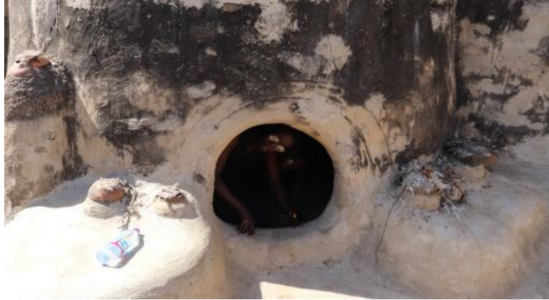
Figure 5a. The entrance to one of the rooms of the traditional roundhouses in Chief Golobdan's compound