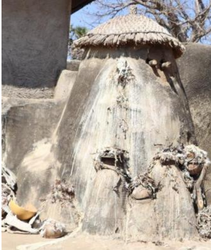
Figure 6a. Personal deity of Chief Golobdan. Appears as a building but an abstract artistic figure representing the personal deity of the chief.