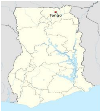
Figure 1. Location of Tongo in Upper East Region on Ghana Map.

backgrounds who seek its protection and blessings. Visitors from various parts of the world journey to the shrine, drawn by a multitude of reasons, to seek counsel from the deity.