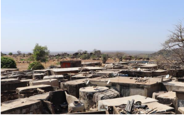
Figure 3. Partial aerial view showing the flat rooftops of the buildings Chief Golobdan's house.

The utilitarian ingenuity of the circular buildings extends to the rooftops, which serve as impromptu sleeping mats during excessively warm seasons, providing respite when the interior temperatures become intolerable. Additionally, these rooftops double as elevated platforms for the purpose of drying grains and hay, exemplifying their multifunctional nature (Mahamadu, 2016)[13]. Constructed with meticulous engineering finesse, these traditional circular edifices are reinforced with seven robust sticks serving as foundational columns. Subsequently, smaller sticks are intricately interwoven before applying a layer of clay to fashion the top and body of the structure (refer to Figure 4).