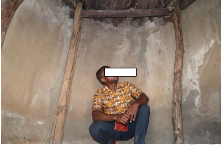
Figure 4. A pose inside the traditional roundhouse in Chief Golobdan's compound showing how the sticks were used as columns to support the flat roofing. (Source: Fieldwork, 2020 ).