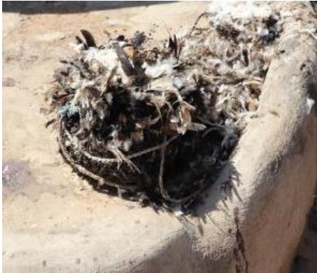
Figure 6b. Details of installation of rope and guinea fowl feathers mixed with blood stains.

Intriguingly, the internal dimensions of these remarkable indigenous structures average about seven feet in height and possess a four-foot radius, rendering them both spacious and conducive to unhindered standing or sleeping. Noteworthy is the application of cement to both the interior and exterior walls, as well as the floors, although historical records indicate that clay was the predominant material in the past. From a scientific standpoint, these circular dwellings exhibit structural resilience against natural forces, adeptly regulate room temperatures, and mitigate noise, thereby facilitating restful sleep—a deliberate architectural consideration implemented by our forebears [14]. Furthermore, the central courtyard within the chief's residence serves as the sanctum for Chief Golobdan's personal deity.