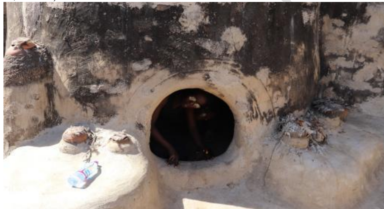
Figure 5a. The entrance to one of the rooms of the traditional roundhouses in Chief Golobdan's compound