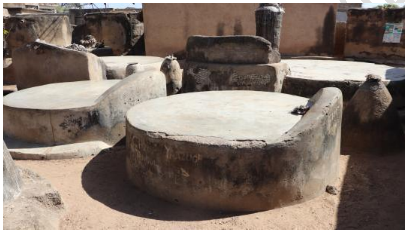
Figure 8a. Circular tombs at the private mini-cemetery behind the house of Chief Golobdan.

Remarkably, situated behind one of the structures, in proximity to a substantial baobab tree, lies a discrete mini-cemetery where some of the ancestors, including Chief Golobdan's late father, find their eternal rest. A noteworthy observation is the meticulous construction of these tombs in near-perfect circular forms, adorned with configured installations comprising sticks, earthenware pots, calabash, feathers, and bloodstains, collectively creating an ambiance reminiscent of a shrine (refer to Figures 8a & 8b) dedicated to the venerable practice of ancestor veneration.