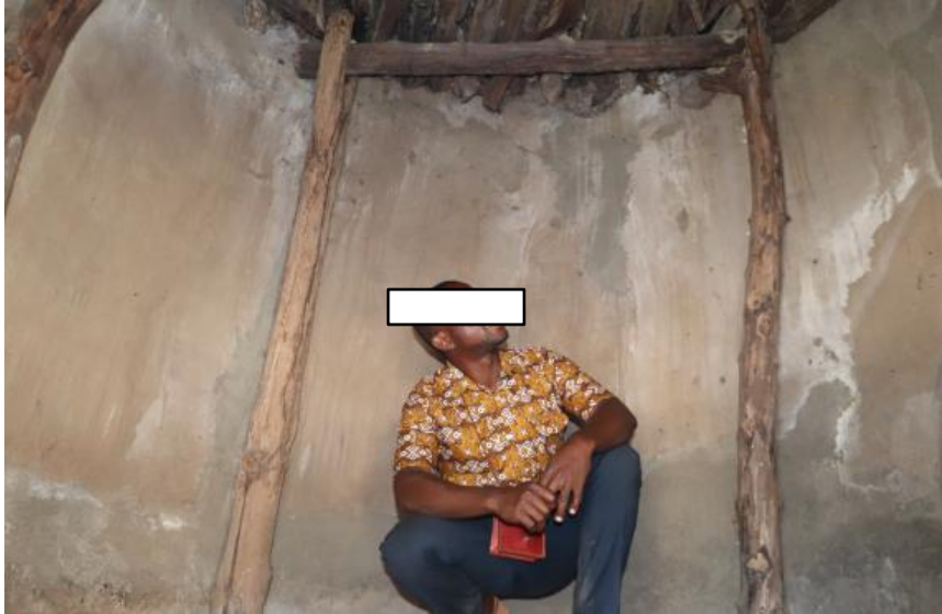
Figure 4. A pose inside the traditional roundhouse in Chief Golobdan's compound showing how the sticks were used as columns to support the flat roofing. (Source: Fieldwork , 2020).