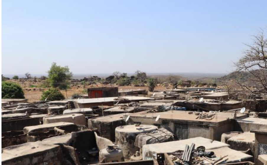
Figure 3. Partial aerial view showing the flat rooftops of the buildings Chief Golobdan's house.

The utilitarian ingenuity of the circular buildings extends to the rooftops, which serve as impromptu sleeping mats during excessively warm seasons, providing respite when the interior temperatures become intolerable. Additionally, these rooftops double as elevated platforms for the purpose of drying grains and hay, exemplifying their multifunctional nature (Mahamadu, 2016)[13]. Constructed with meticulous engineering finesse, these traditional circular edifices are reinforced with seven robust sticks serving as foundational columns. Subsequently, smaller sticks are intricately interwoven before applying a layer of clay to fashion the top and body of the structure (refer to Figure 4).