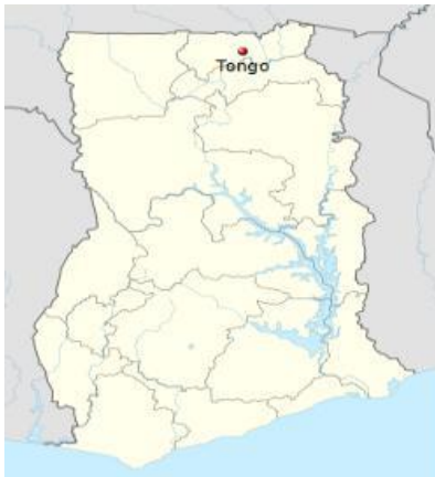
Figure 1. Location of Tongo in Upper East Region on Ghana Map.

protection and blessings. Visitors from various parts of the world journey to the shrine, drawn by a multitude of reasons, to seek counsel from the deity.