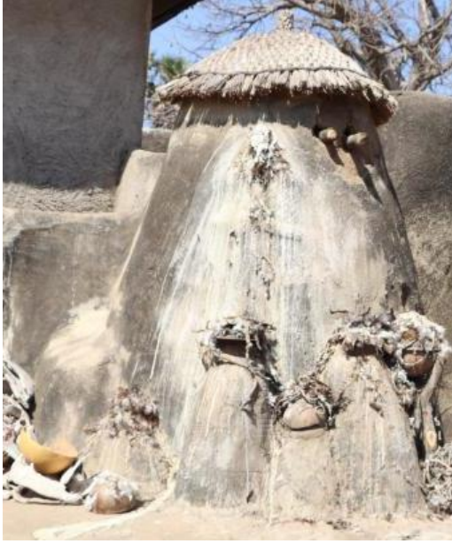
Figure 6a. Personal deity of Chief Golobdan. Appears as a building but an abstract artistic figure representing the personal deity of the chief.