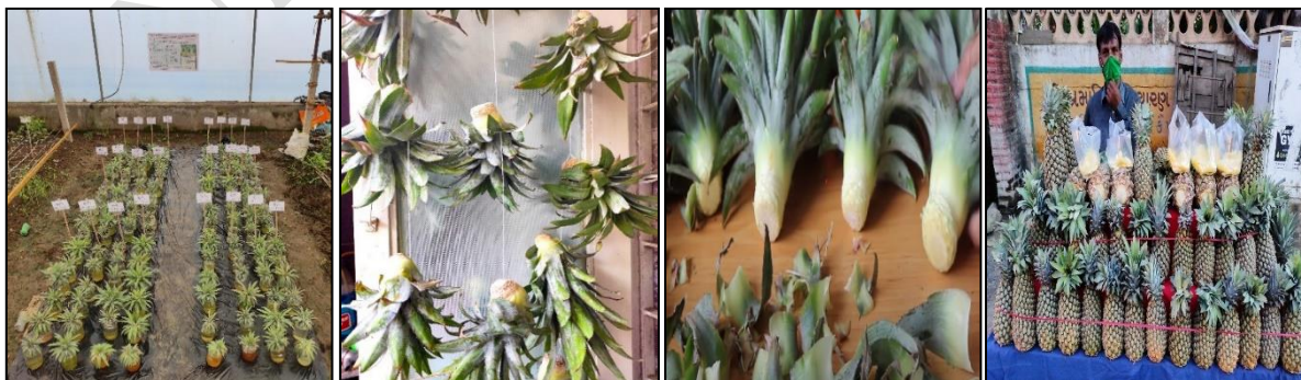
Figure 1. A. Collection of crowns, B. Removing leaves & excess parts, C. Sun Drying of pineapple crown for 24 hrs. D. General layout of experiment

Various parameters were assessed in this experiment, including number of days required for rooting, percentage of rooted crown, length of root, number of roots, fresh and dry weight of root, number of leaves, length of leaves, fresh and dry weight of shoot. All the data collected on these growth parameters were subjected to statistical analysis using the methods recommended by Panse and Sukhatme (1985).