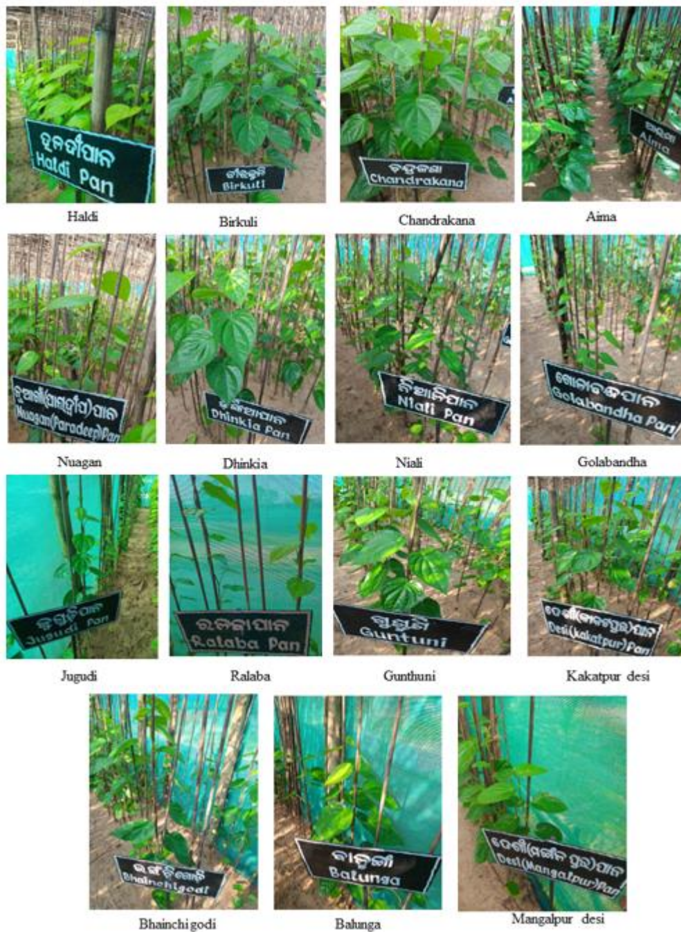
Fig. 2. Morphological variations of leaves in different betel vine variety