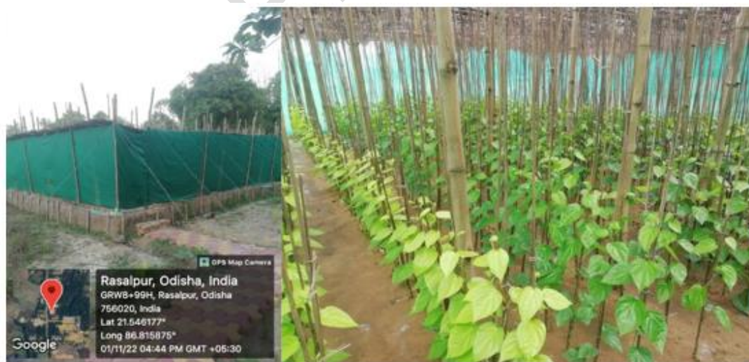
Fig. 1. Outside and inside view of “Pana Baraja” at F.M. University Balasore