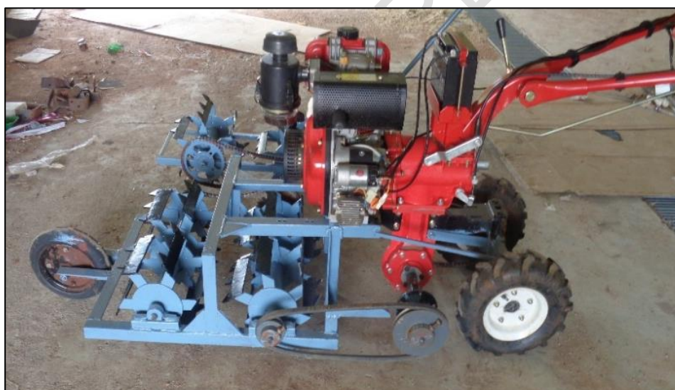
Fig .1 Developed self-propelled rotor power weeder

The rotor weeder is attached to prime mower of 5 hp Honda diesel engine. It was designed and developed at the Department of Farm Machinery and Power Engineering, College of Agricultural Engineering, Acharya N.G. Ranga Agricultural University, Madakasira. Overall dimensions of the machine length x width x height was 2000 x 660 x 1200 mm. The three major components of the developed machine are main frame, weeding assembly and power transmission system. Width of coverage of implement was designed to suitable for both 30 cm and 60 cm row spaced crops by an adjusting the spacing between two rotors. An amount of rupees 8050 were spent for development of the self-propelled rotor power weeder.