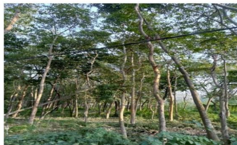
MGNREGA Afforestation in Bihar (Hajipur and Muzaffarpur)