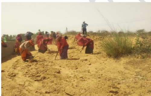
Land Development work in Rajasthan

Environmental renewal takes place when MGNREGA assets are developed, and as a result, many spin-off benefits to the environment are produced in a sustainable manner. The programme makes a significant contribution to natural resource management (NRM) by requiring that 60% of its annual total spending go toward water collection and conservation, plantation, land and soil improvement, and other NRM-related projects. Study showed that MGNREGA's initiatives have reduced the vulnerability of agricultural productivity, water resources, and livelihoods to unpredictable rainfall, water shortages, and low soil fertility conditions (Tiwari et al., 2011). Another study found that the programme is producing many environmental advantages that enhance water availability and soil fertility and increase agricultural productivity. People's socioeconomic and cultural existence in rural areas is inextricably linked to the environment. In general, seasonality, topography, forests, soil, rivers, and other natural features such as these are intimately tied to the traditional cultural structures and agro-based economic activities of rural civilizations. The various MGNREGA programmes are closely connected in their efforts to safeguard natural resources and develop their potential sustainability. The most significant programmes are conservation and harvesting of water, plantations, drought-proofing, land development, micro irrigation, flood control, and flood protection (Plate 1, Figure 1).