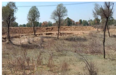
Water conservation work in Rajasthan