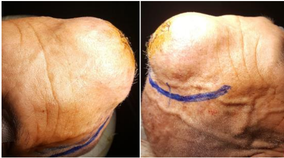
Figure 1: pictures showing a sizable mass in the medial frontal region