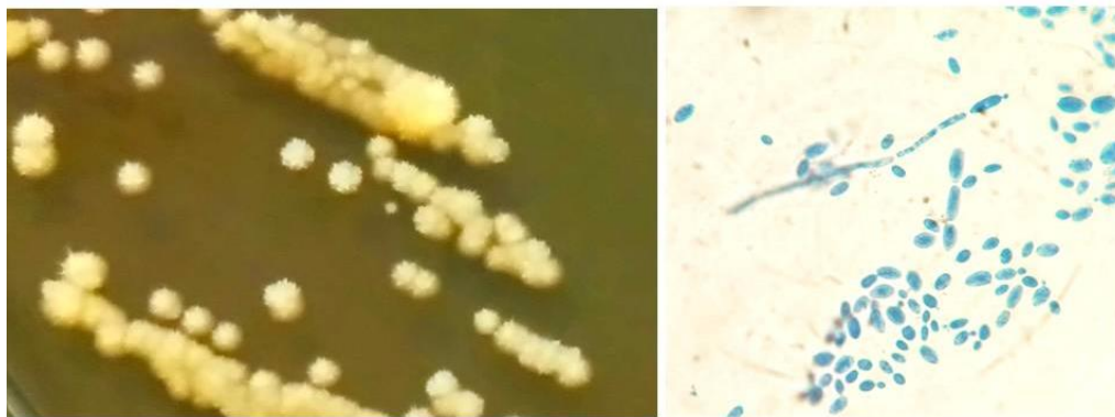
Fig. 1. Cultural and morphological characters of Saccharomycopsis fibuligera on Potato dextrose Agar and under 40x of compound microscope [19]

S. fibuligera has been isolated from several traditional cereal-based alcoholic beverages all around the globe including Xiaoqu [25], Daqu [3], Nuruk [26], Dombea [26] and Xaaj [19], basically fermented individually from rice, wheat, barley, sorghum, others grains, pea and their combinations.