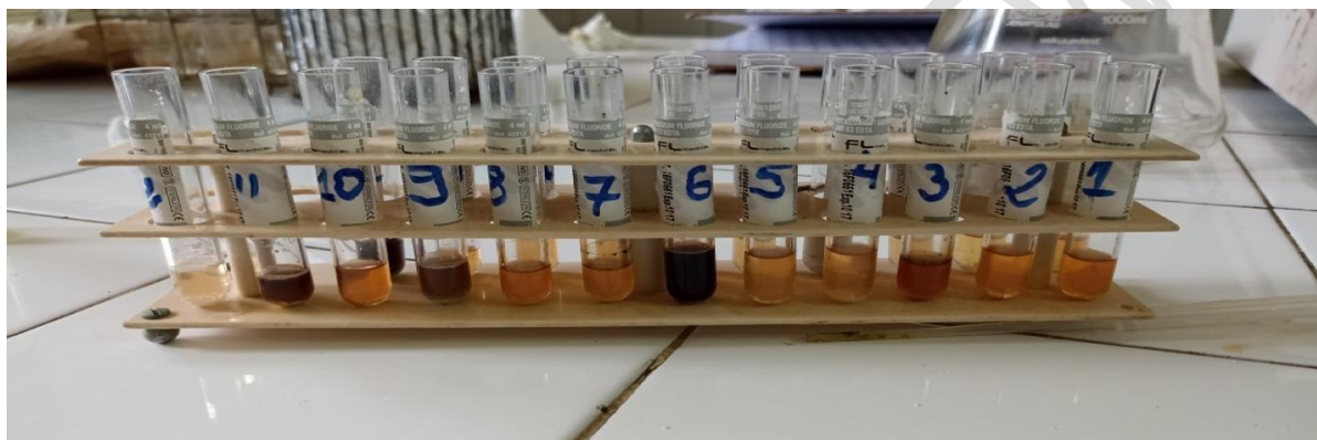
Figure 1: Phytochemical testing equipment in the laboratory

From the results obtained in the table above, it should be noted that the methanolic extract of Cassia sieberiana leaves is very rich in polyphenols, flavonoids and tannins (condensed and hydrolysable).