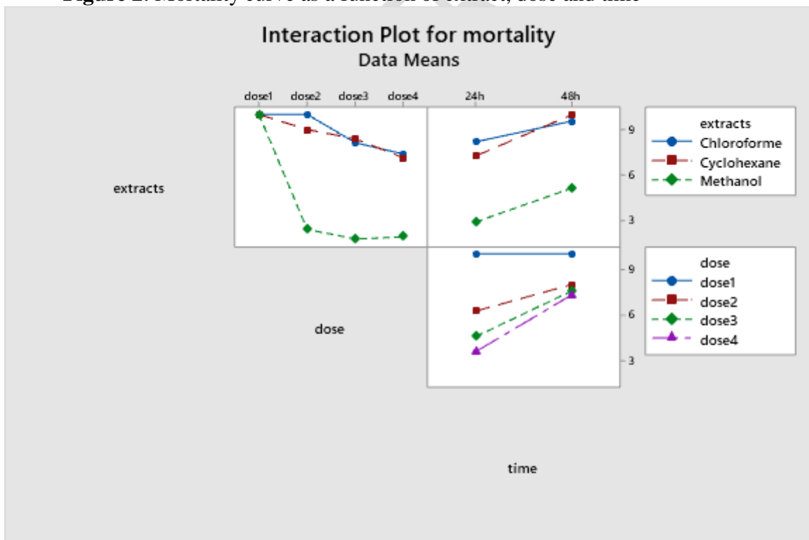
Figure 3: Interaction between extracts and doses, extracts and time, doses and time.