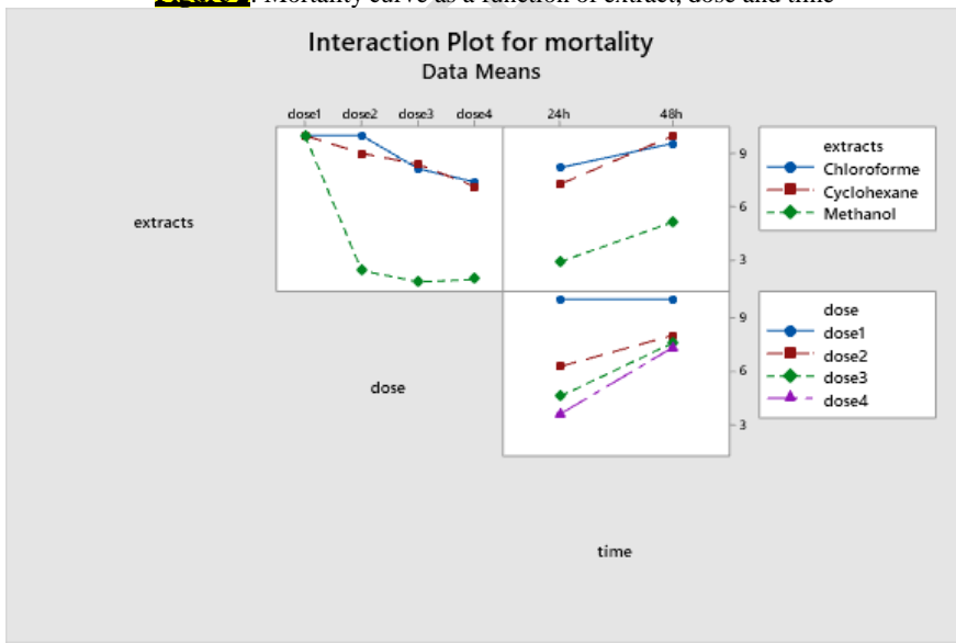
Figure 3: Interaction between extracts and doses, extracts and time, doses and time.