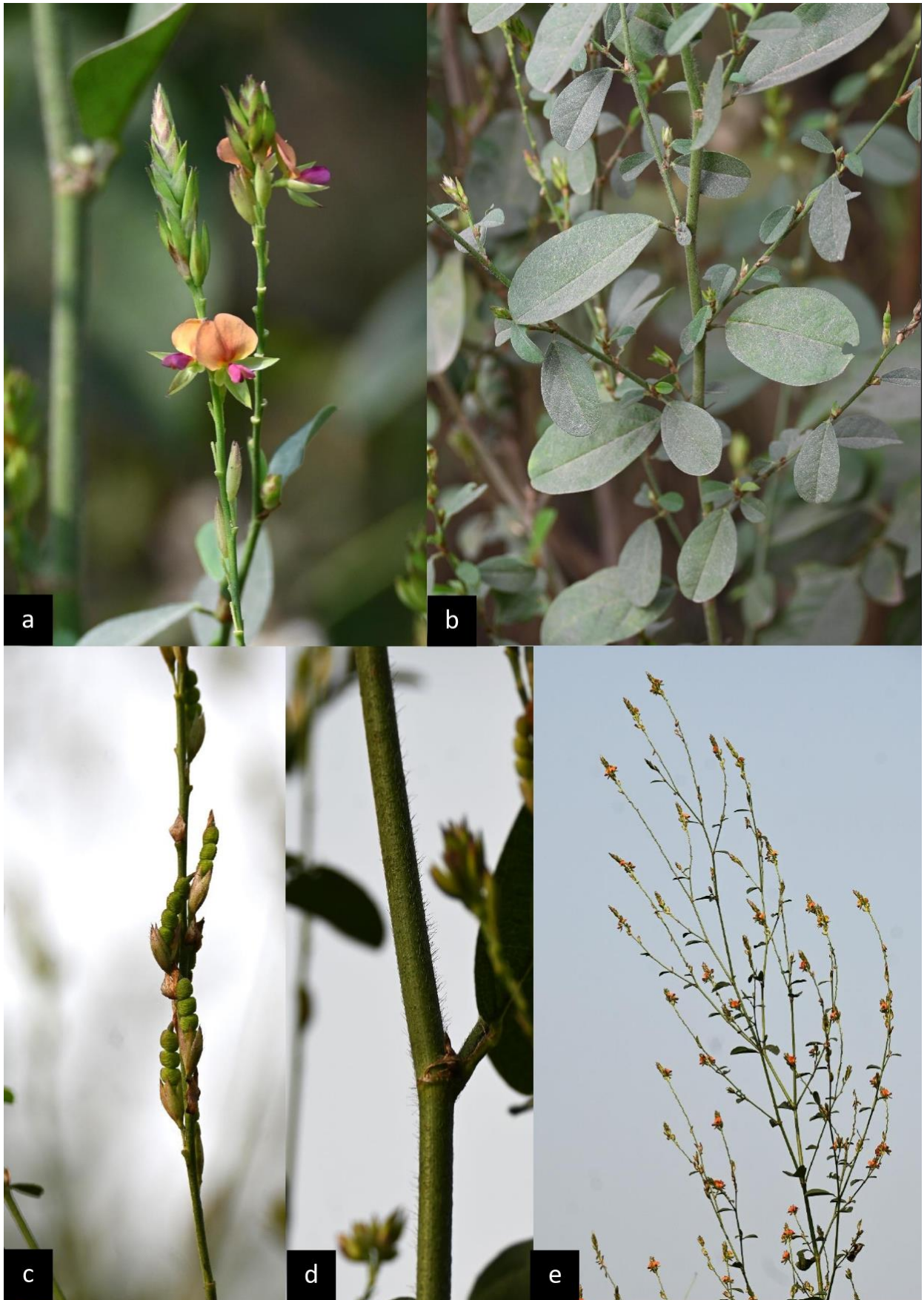
Figure 1: Alysicarpus rugosus : a) Flower b) Leaves c) Fruits d) Stem e) Inflorescence