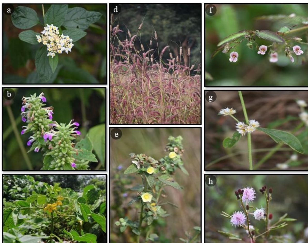
Figure 3: Associated plant species of Alysicarpus rugosus : a) Ageratum conyzoides , b) Anisomeles indica c) Senna tora d) Cenchrus pedicellatus e) Sida cordifolia f) Aeschynomene americana g) Alternanthera sessilis h) Mimosa pudica

Specimen examined: India, Odisha, Sundargarh district, Rourkela Forest Division, Kansbahal, N22°14.966', E84°39.269' elevation 217 m, 26 th November 2023. R.S. Devi 080 (APRFH) (Figure 2).