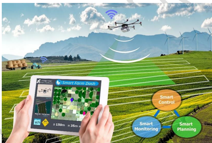
Pic 1. Here we review key developments across these intersecting precision agriculture tools.

Numerous advanced sensing and monitoring technologies now enable precise spatiotemporal measurements of crop and field parameters for input into data analytics systems guiding tailored management interventions [20]. Major sensing innovation categories include satellite and aerial remote sensing platforms, proximal crop and soil sensors mounted on machinery, variable rate technologies altering inputs, wireless sensor networks, and imaging systems [21].