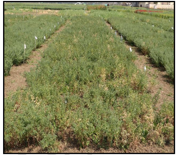
D 2 (Drought stress at flowering up to physiological maturity)