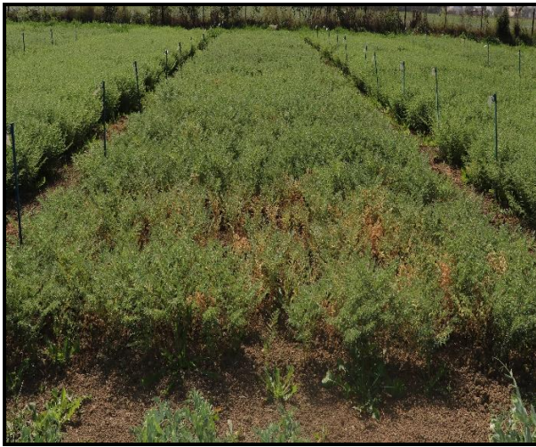
D 1 (Irrigation at 30 DAS and flower initiation)

a F-values. ns: not significant F ratio ( p < 0.05 ); *, ** and *** indicates significance at P < 0.05 , 0.01 and 0.001, respectively.