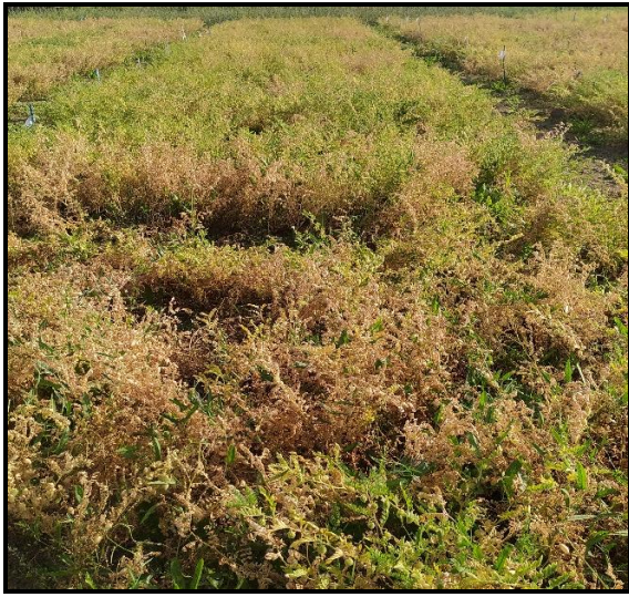
V 1 - JG 36 (Late maturity)