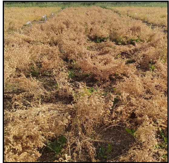
V 2 - JG 14 (Early maturity)