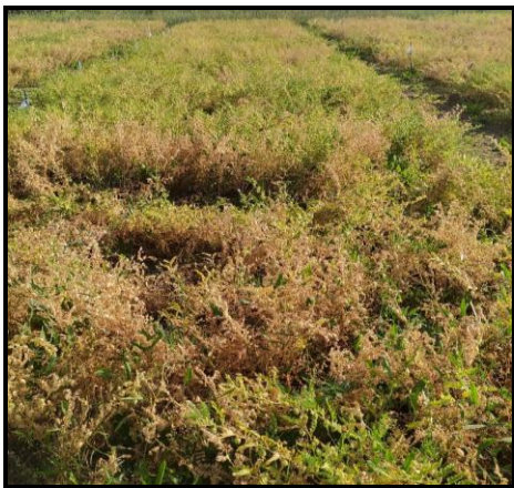
V 1 - JG 36 (Late maturity)