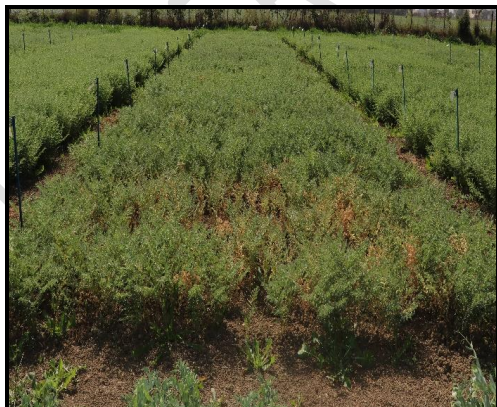
D 1 (Irrigation at 30 DAS and at flower initiation)