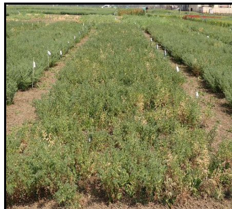
D 2 (Drought stress at flowering up to physiological maturity)