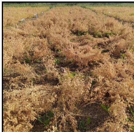
V 2 - JG 14 (Early maturity)