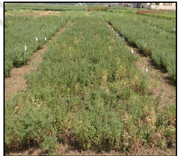
D 2 (Drought stress at flowering up to physiological maturity)